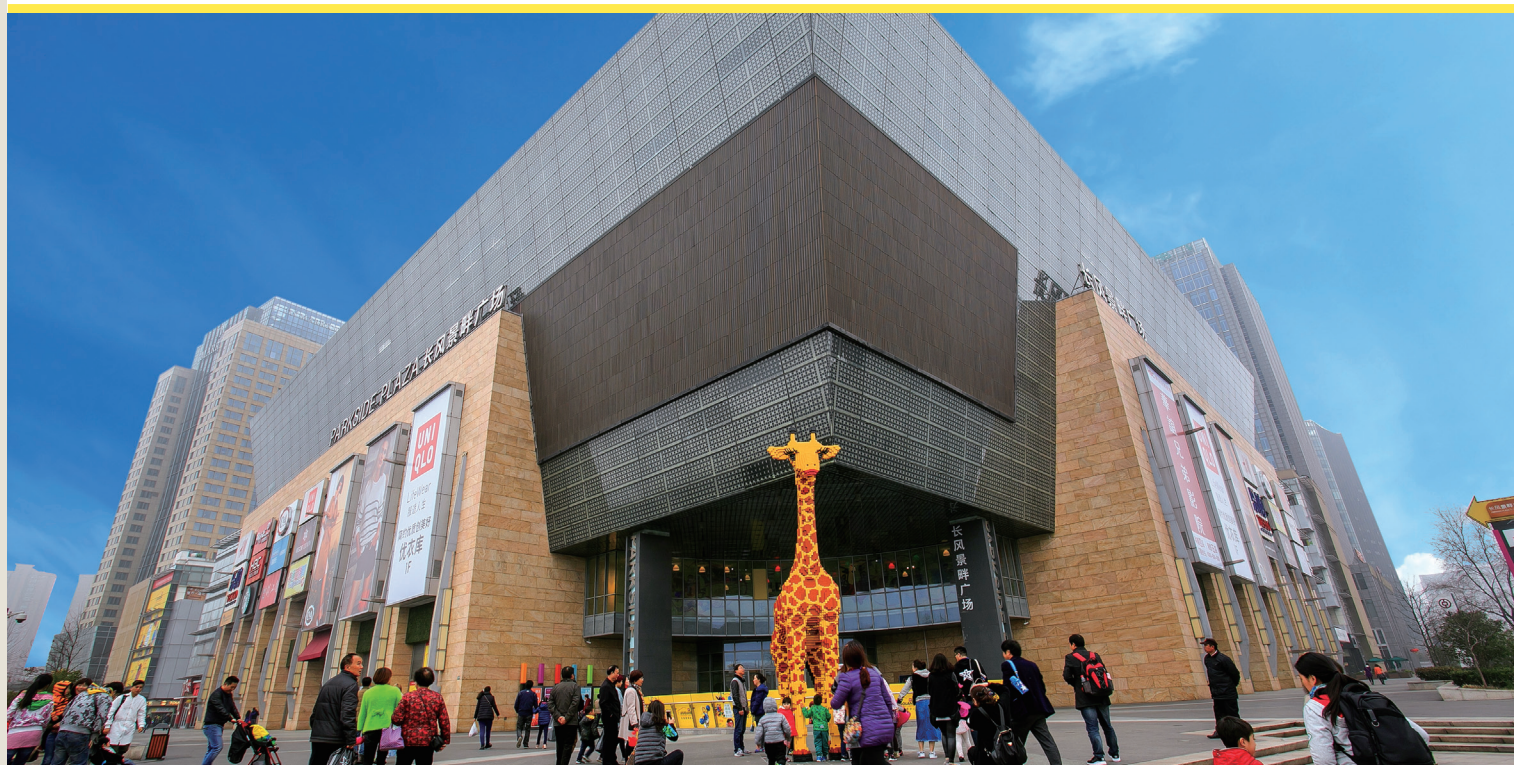
Image: Parkside Plaza, Putuo district